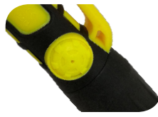
Ventil / valve