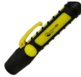
Clip- Positionen / position clip