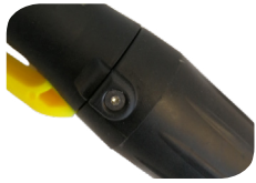
Verschluss / fastener